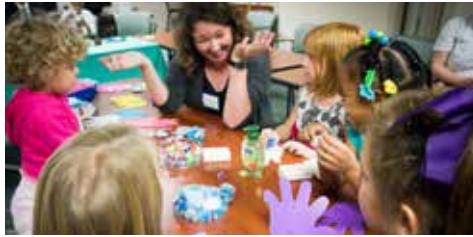
A Hand to Hold staff member leads a craft session for NICU siblings at St. David's Medical Center in Austin, TX.