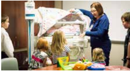
Siblings learn about their little brother/sister's NICU stay from a licensed nurse at St. David's Medical Center in Austin, TX.

In partnership with St. David's Healthcare, Hand to Hold leads monthly education hours for older siblings of NICU babies. Siblings learn about the special people caring for their baby brother or sister, the equipment that is helping their baby grow stronger each day and the important role they will play as a big brother or sister when their baby comes home. Siblings also enjoy crafts, songs and ice cream sundaes!